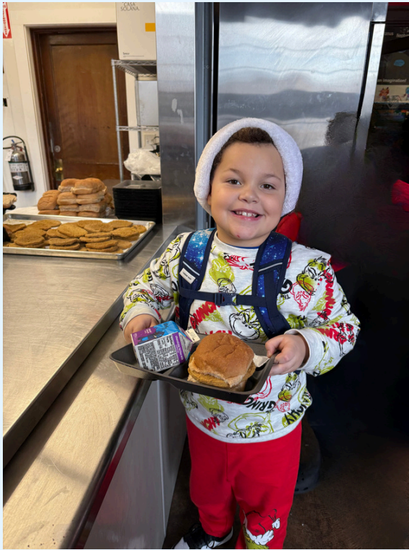
FULL BELLIES = BIG SMILES

In 2025, nearly 20% of children across the U.S. experienced food insecurity. Overall food insecurity rose 16% in November 2025 alone because of changes within the federal government.