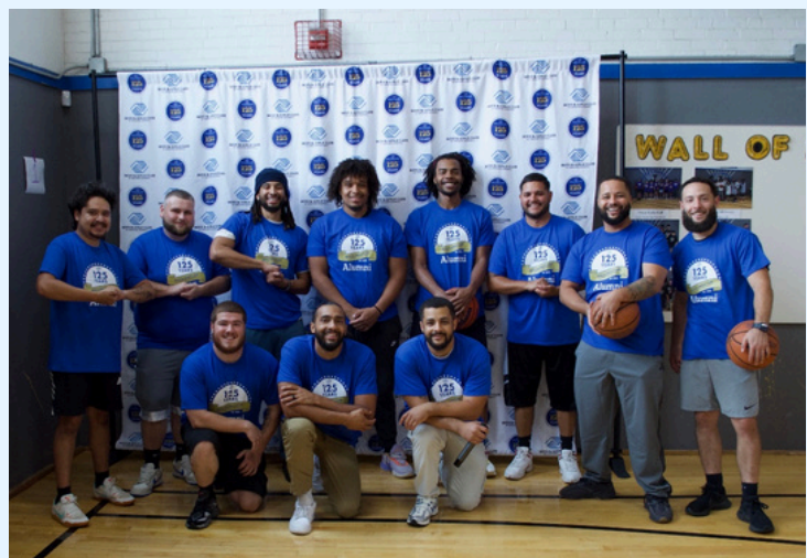
ALUMNI BASKETBALL PLAYERS