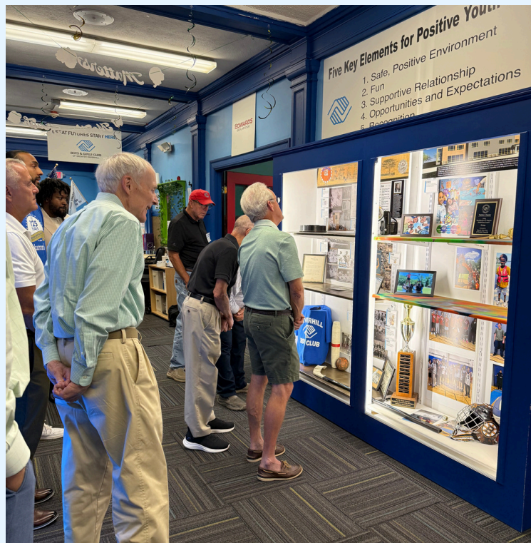
ALUMNI ENJOYING THE UNVEILING OF THE MEMORABILIA CASE

On September 6 th we held a basketball tournament with some classic games like 100s, which brought out many previous staff members and recent alumni.