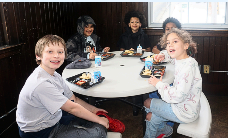
FUEL FOR THE FUTURE!